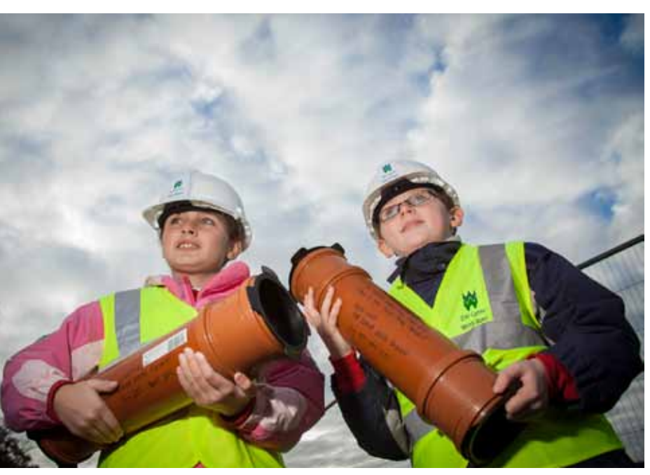
Placing the time capsule in Coed Dolwyd Service Reservoir foundations

The use of geospatial technology to map and capture these underground assets could be effective. This will provide a much clearer understanding of where and how many underground assets exist and which of these assets are vulnerable. Mapping is undertaken as part of the development process.